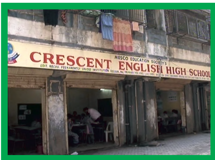
A Humble Beginning ... [1993 - 2009]

B] With growing demand for higher education and limited degree colleges in the Mumbra area, we propose to upgrade Crescent English High School & Jr. College into a Degree College. This will provide accessible & affordable higher education for local students, especially girls and the underprivileged. We also plan to add two additional divisions per class to accommodate the rising number of students and reduce admission pressure. This expansion is a step toward fulfilling our mission of providing quality education from nursery to graduation under one roof.