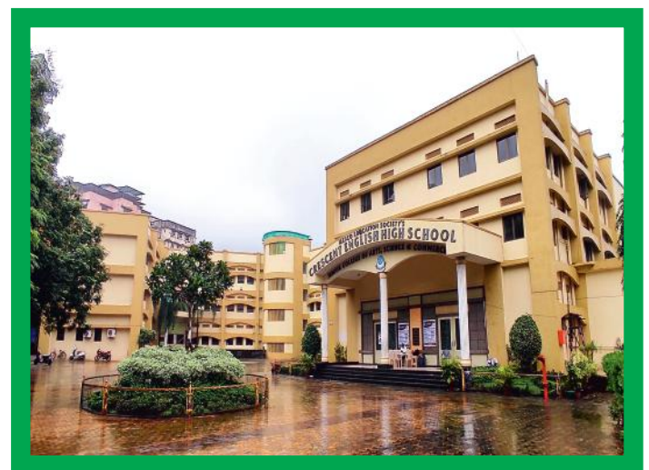
Existing building of Crescent English High School & Jr. College constructed in the year 2010 with 1750 students on its roll.

Crescent English School initiated in 7 shops in 1993 and later spread to 27 shops in other two adjoining buildings.