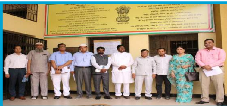
Representatives of Islamic Development Bank (Western India Region) visited Crescent English High School & Jr. College.