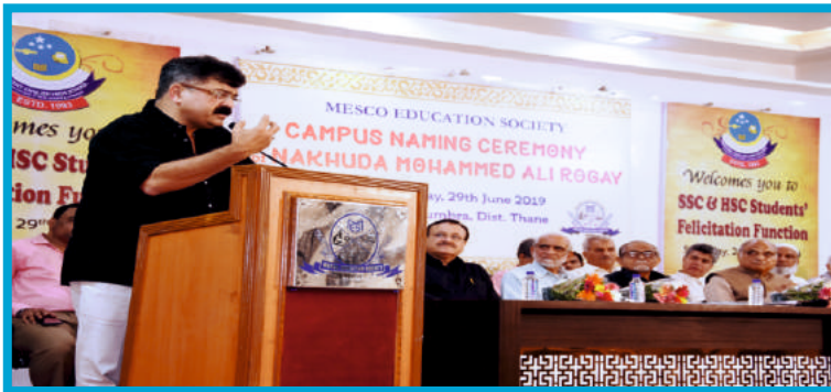
Dr. Jitendra Awhad (MLA & Cabinet Minister for Housing) addressing a gathering during the Campus Naming Ceremony of the New School Plot.