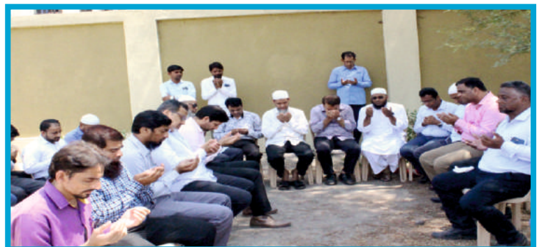
Prayers were offered for the Construction of the New School Building.