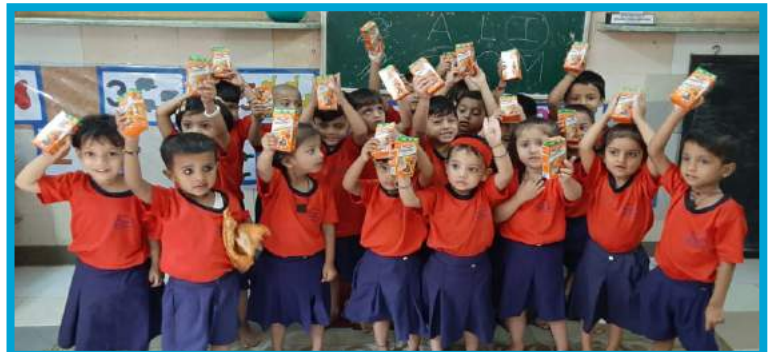
Nursery School Students enjoying Dabur Energy Drinks, sponsored by M/s. Dabur under CSR