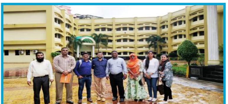
A CSR Team of M/s. Nadiadwala Grandson Entertainment Pvt. Ltd. visited Crescent English High School & Jr. College.