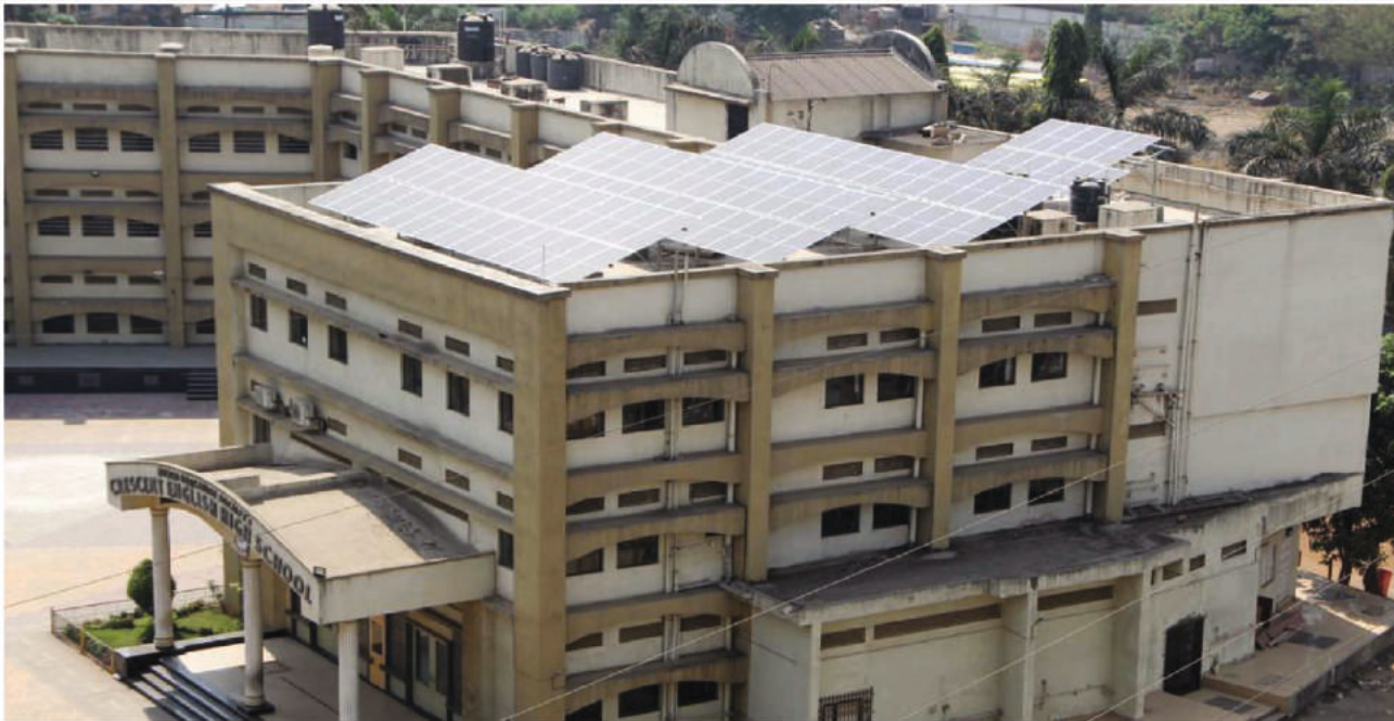
70% of the school's electricity requirements will be met through the rooftop solar plant.

The Mesco Education Society's Crescent English High School and Junior College has become the first school in Mumbra to adopt green energy to power its electricity requirements.