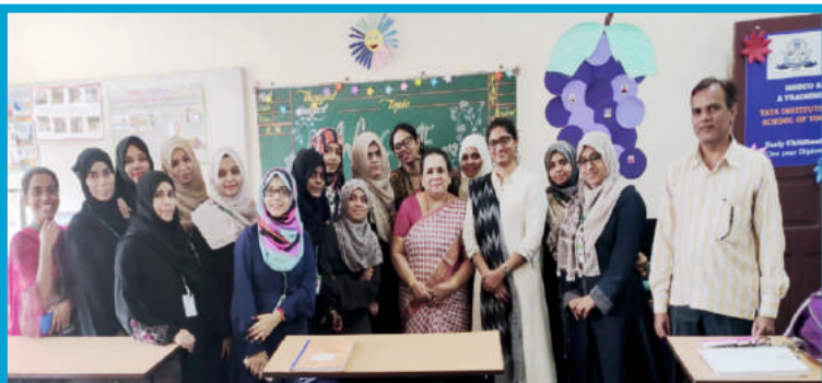
ECCEd Course Students with the Course Director and other faculty members.